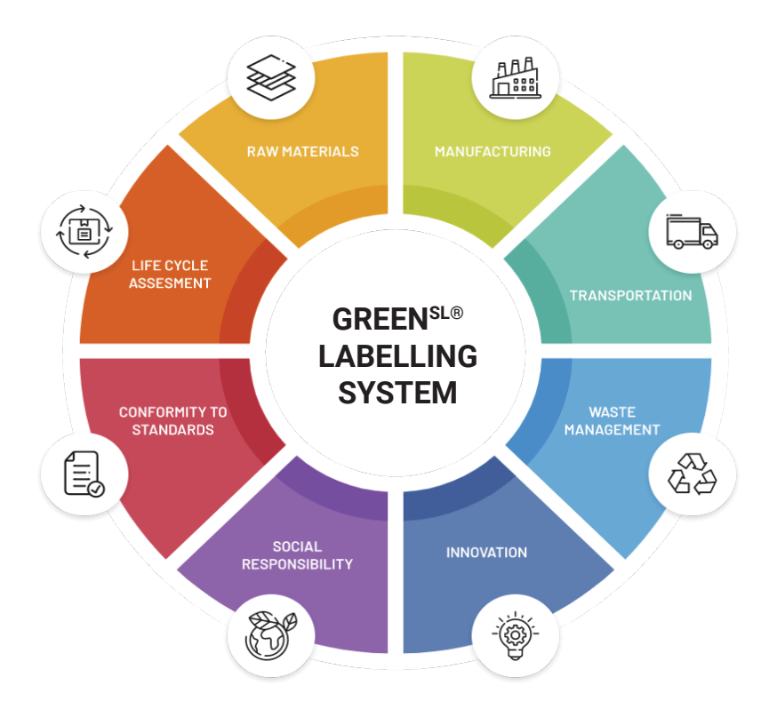
Figure 1. GREEN<sup>SL®</sup> Labelling system