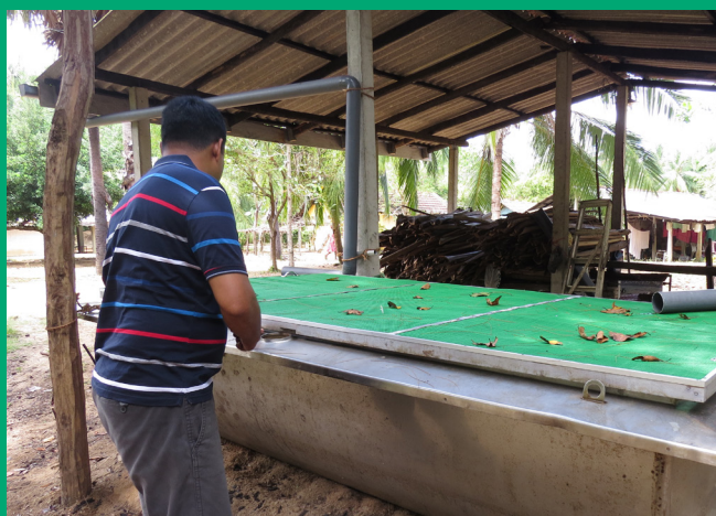
Creation of bio-char