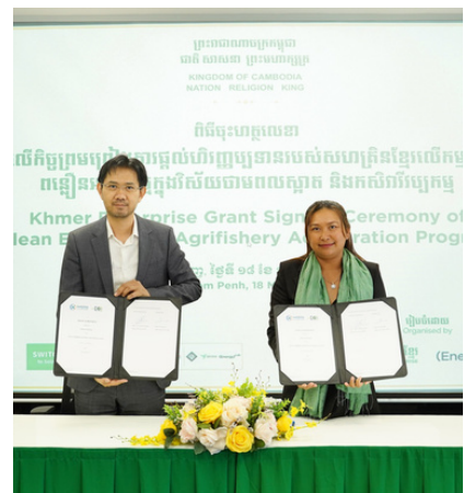
Seed Investment Grants Signing Agreement