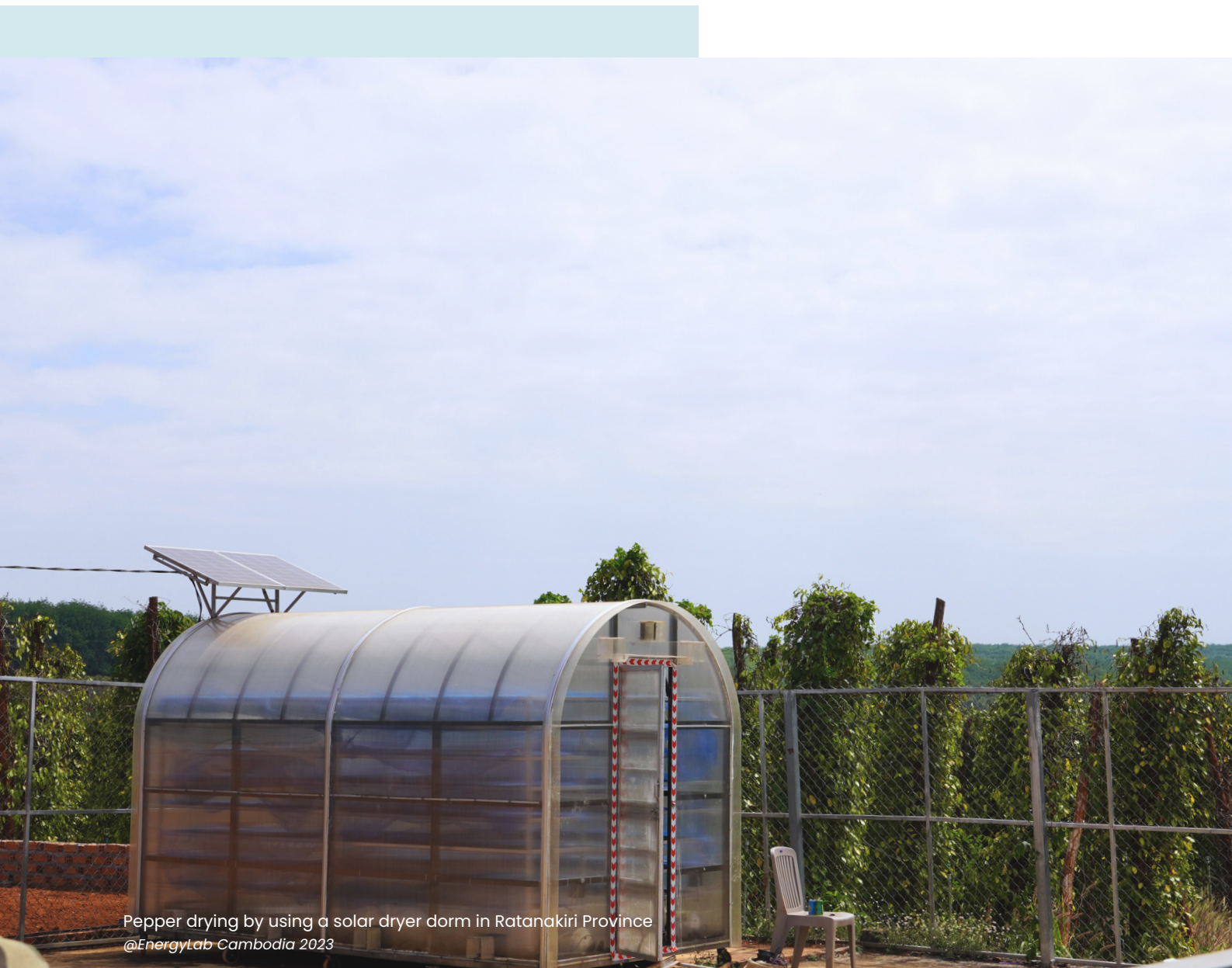
Pepper drying by using a solar dryer dome in Ratanakiri Province @EnergyLab Cambodia 2023

Establishing a conducive environment and strengthening startups' capabilities not only bolsters social growth and economic development, but also contributes positively to coping with environmental issues. The rise of solar-powered solution designs and their deployment plays a crucial role in reducing carbon emissions. For instance, upon the adoption of solar water pumps, farmers no longer use the diesel-powered water pumps, which decreases GreenHouse Gases emissions and other air pollutants, fostering good well-being for human beings.