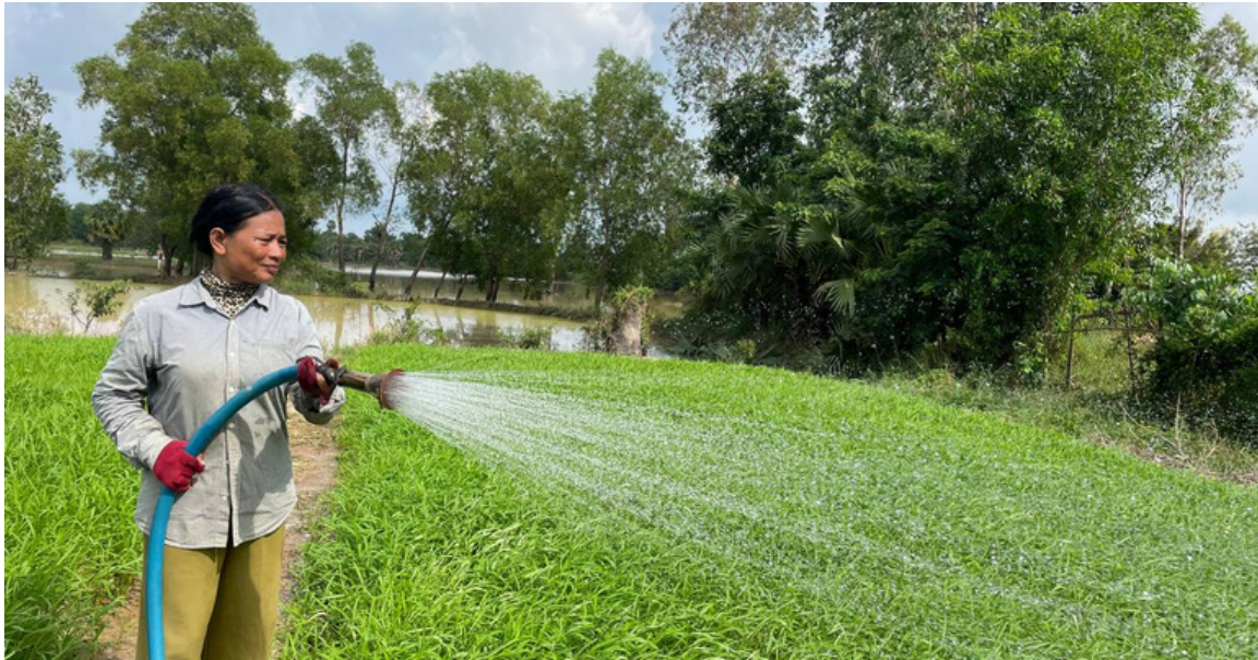
Solar water pump installation for a demonstration site in Takeo Province under the support of Khmer Enterprise through the SWITCH to Solar Acceleration Program