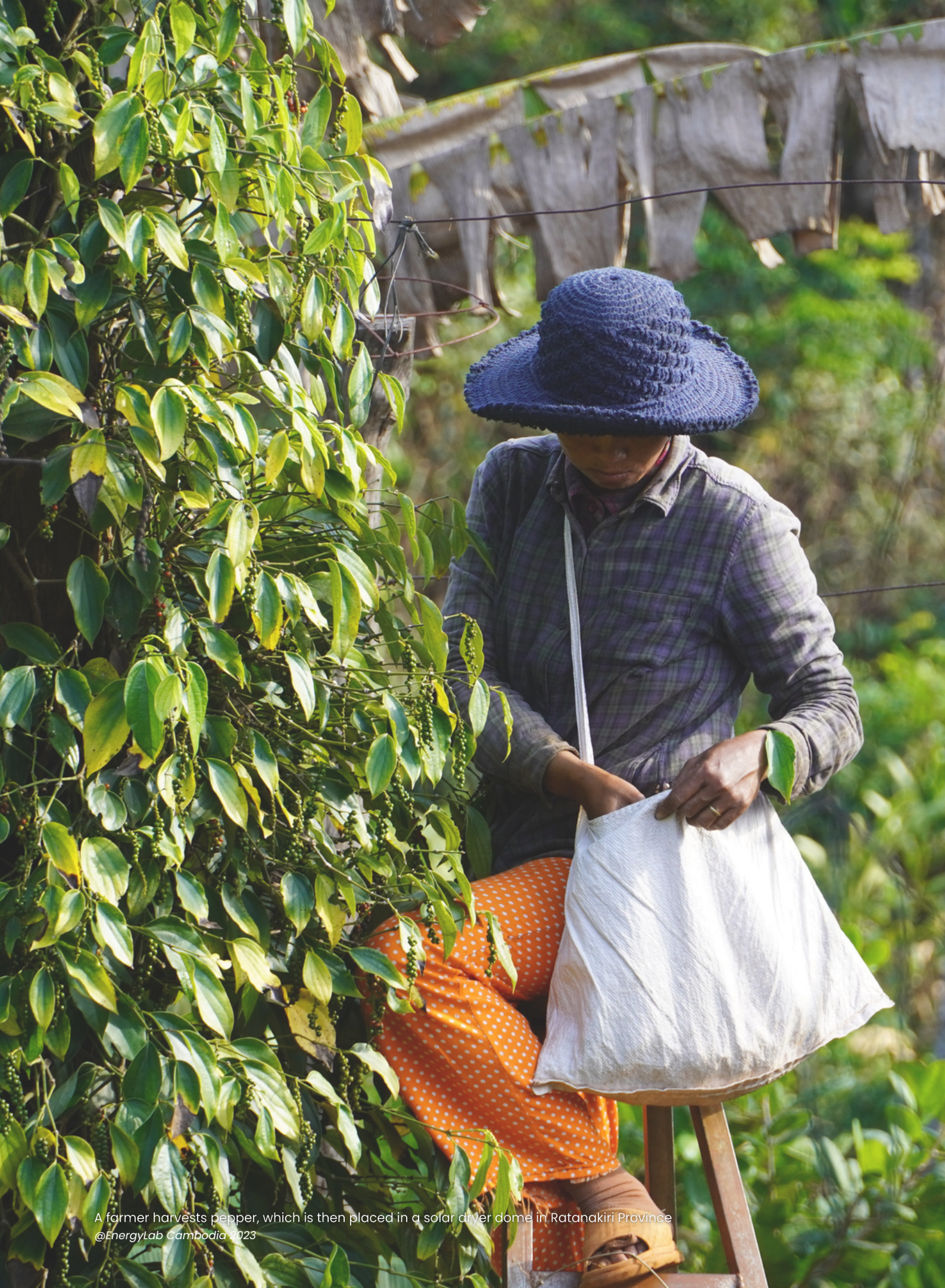
A farmer harvests pepper, which is then placed in a solar dryer dome in Ratanakiri Province