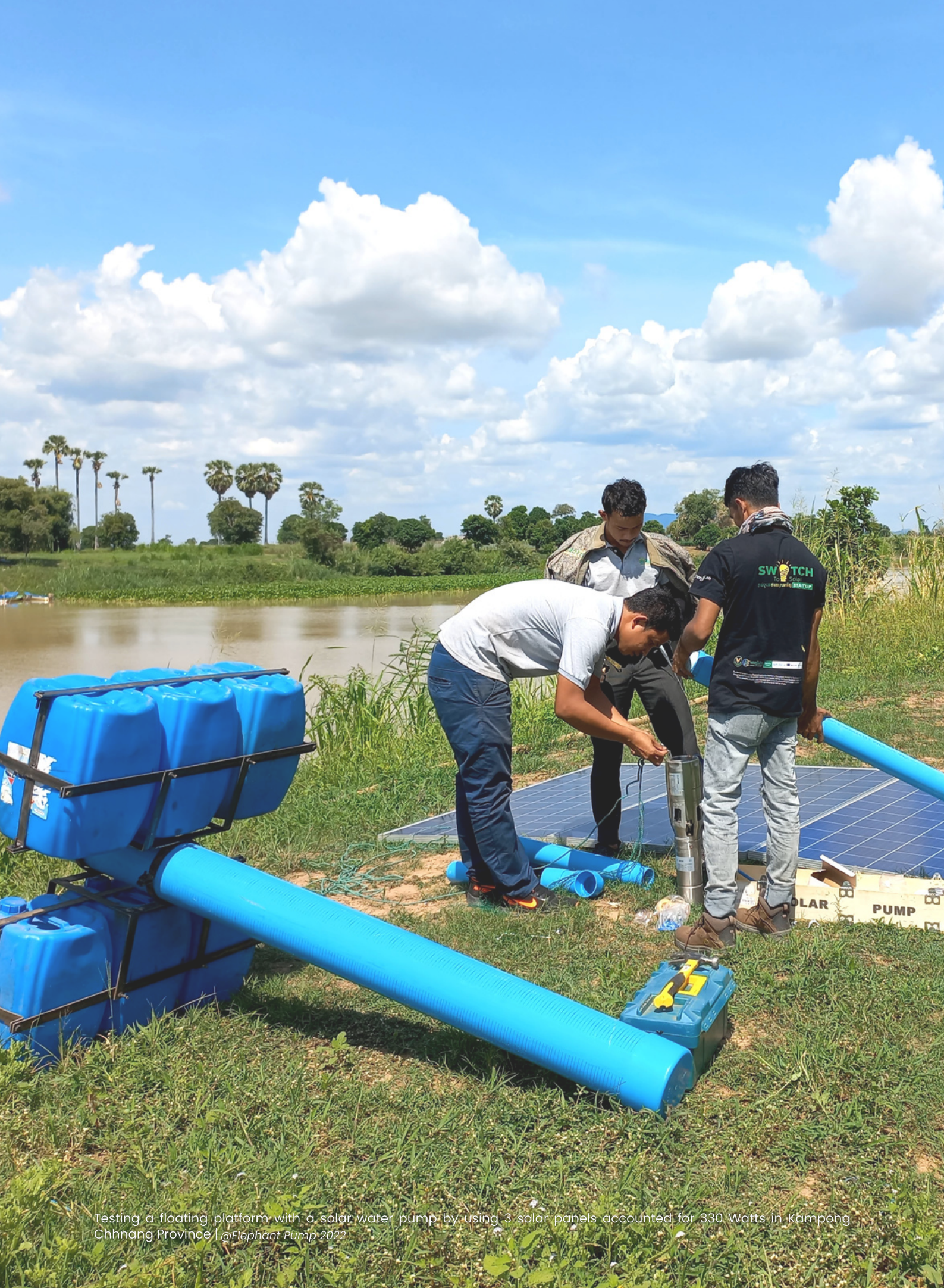
Testing a floating platform with a solar water pump by using 3 solar panels accounted for 330 Watts in Kampong Chhnang Province