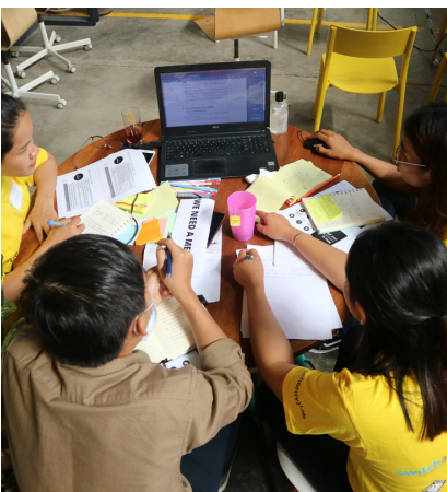
Bootcamp Activities in Incubation and Acceleration program

In addition to the capacity-building training provided by EnergyLab, collaboration among program attendees has proven to be crucial in supporting the startups to secure necessary funding and growth. Consequently, 10 startups from the Incubation and Acceleration Programs were successful in acquiring USD 7.5K per team as “ Seed Investment Grants ” from Khmer Enterprise, a national enterprise platform that supports entrepreneurial activities.