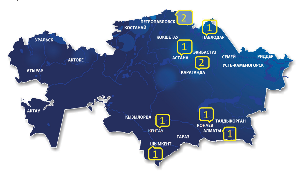
Figure 1. Map of plastic packaging waste disposal facilities

Based on the data on the location of plastic waste processing facilities, the following map was compiled (Figure 1.)