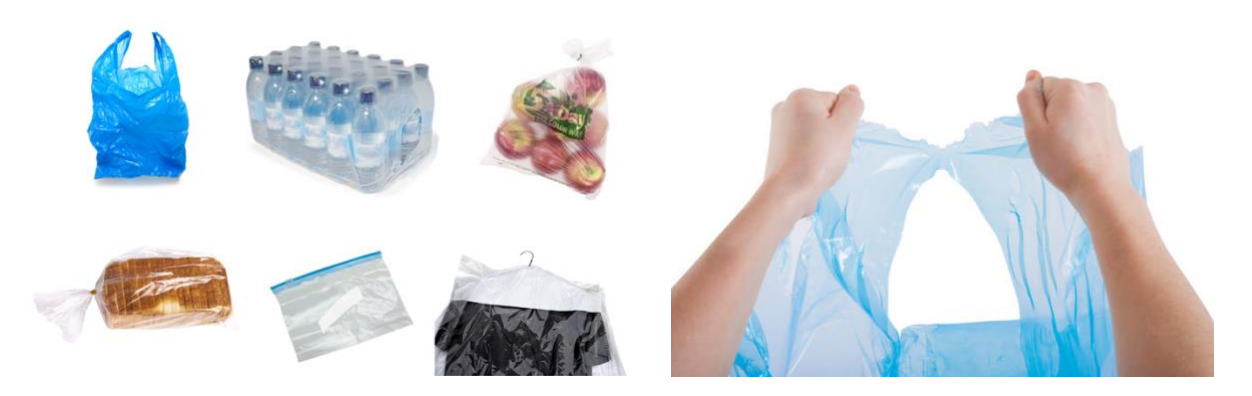
LDPE bags and wrappings