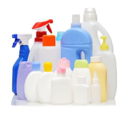
HDPE containers and bottles

HDPE (high-density polyethylene) is essentially used to produce other kinds of plastic containers, such as milk, motor oil, shampoo and conditioner, soap, detergent, and bleach. They can be colored although quite often they are white; in any case, they are rarely transparent like PET bottles, so it is fairly easy to distinguish them. Another big difference is while PET bottles are blown, HDPE bottles and containers are welded, which leaves a straight line in the middle of the bottom (which is absent from PET bottles). Usually, you can confirm by the letters "HDPE" or the recycling symbol with the number "2" (although sometimes these indicators are not marked on these containers).