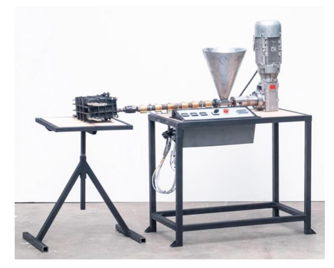
Example of plastic shredder