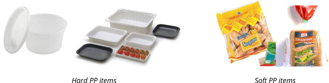
Soft PP items

PP (polypropylene) is mainly used for food product packaging and it is the only type of plastic that is broadly found under both "hard" and "soft" forms. In "hard" form, it is usually used for food containers (for products such as jam or yoghurt) and disposable items (plates, bowls, cups, etc.). It can look quite similar to HDPE containers although it does not have a welding line in the bottom. In "soft" form, it is used to wrap various food products such as bread, biscuits, pasta and so on. As mentioned above, it is fairly easy to distinguish from LDPE wrapping as the texture is quite different and it does not react the same way to the ripping test (it breaks with a straight cut). For confirmation, you can usually find the identification letters "PP" or symbol with the number "5" on most hard and soft PP items and packaging.