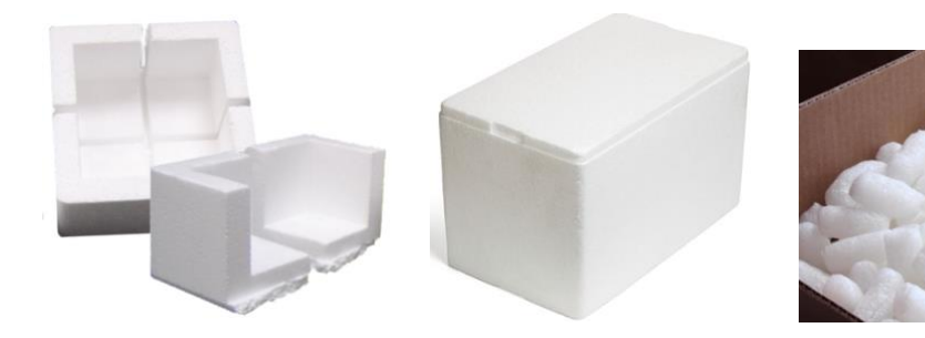
PS protective items

PS (polystyrene) is mainly used in the form of a white rigid foamy material either for its insulating or its shock-absorbent properties. At soum-level waste, we mainly find it in protective boxes, beads and pads.