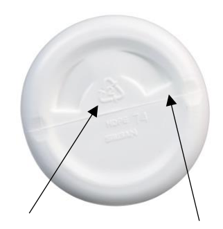
An identification number and welding line