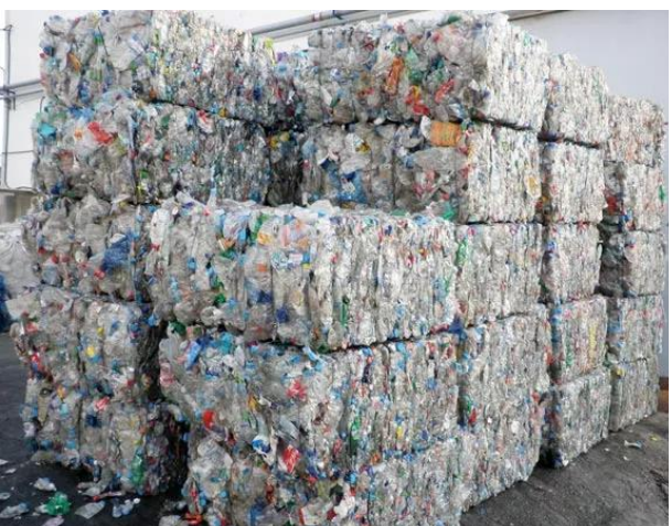
Example of plastic press