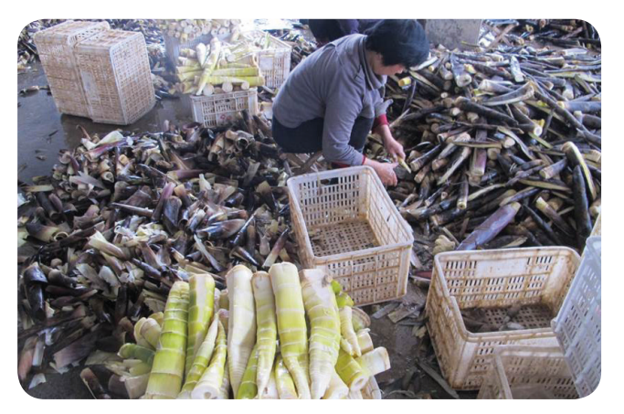
Fresh bamboo shoots to be processed