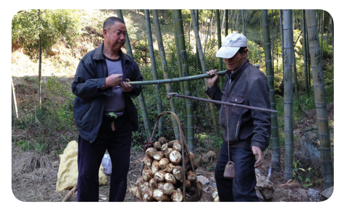
Farmers selling bamboo shoots at road side

The project engaged with local policymakers and contributed to policy formulation in Sichuan and Zhejiang provinces to address the issue of the overuse of preservatives and their contribution to pollution. Training sessions for government representatives and industrial associations to monitor and evaluate sustainable food production were conducted. The project submitted policy recommendations on provincial bamboo shoot processing standards and supported the two provincial governments to adopt the new standards.