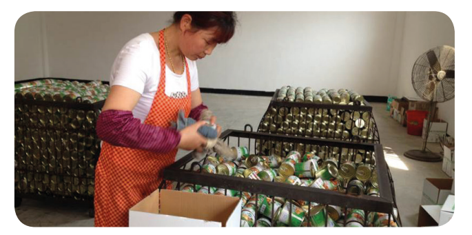
Canned bamboo shoot ready to enter the markets