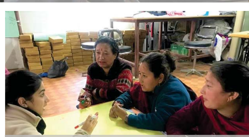
OUTPUT 4.2: Promote Tourism-based entrepreneurship