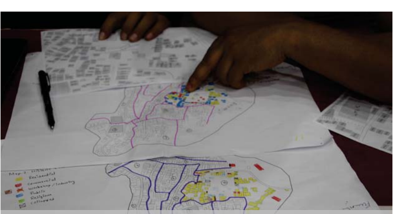
OUTPUT 5.1: Develop sustainable tourism development plan of Bungamati & Pilachhen

EXPECTED RESULT 5: Sustainable tourism supply chain improved by strengthening back / forward linkages