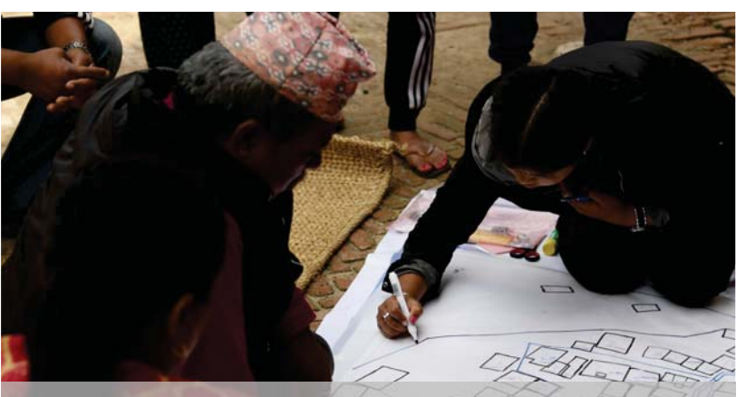
OUTPUT 1.1: Green Heritage Settlement recovery Plan of Bungamati and Pilachhen

EXPECTED RESULT 1: Green rebuilding of Bungamati & Pilachhen further planned and strengthened, the funding thereof prioritized, with a priority for sustainable heritage tourism