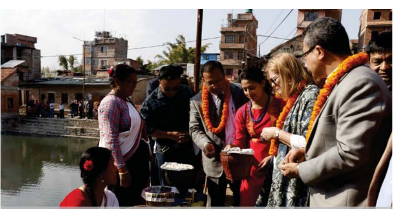
OUTPUT 3.1: Promote green heritage policies & guidelines for reconstruction of heritage settlement

Dialogue platform established to disseminate learnings of Bungamati