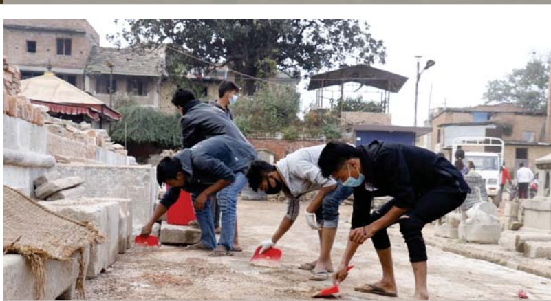
OUTPUT 2.1: Organize neighbourhood groups and build their capacity in neighbourhood management