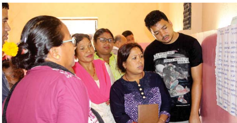
OUTPUT 3.2: Build capacity of stakeholders on green growth and tourism in heritage settlements