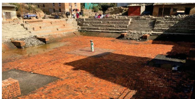
OUTPUT 1.4: Public infrastructure related to heritage and tourism promotion improved