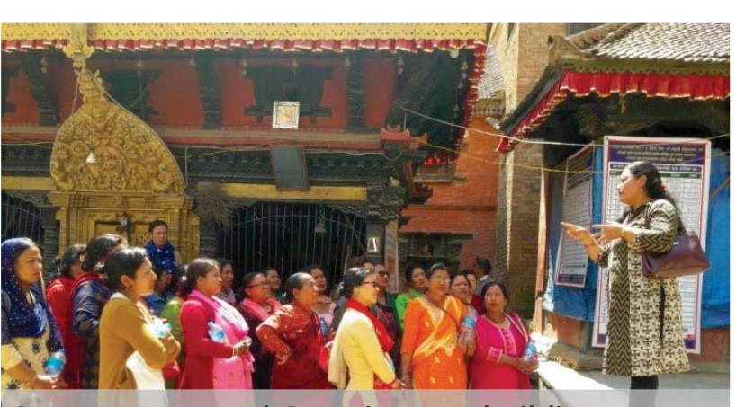
OUTPUT 1.3: Local Capacity on rebuilding green and heritage buildings enhanced