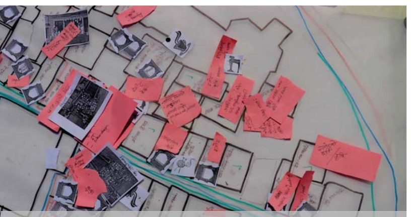
OUTPUT 4.1: Potentiality of youth, women and existing SMEs is surveyed in eco-tourism activities

EXPECTED RESULT 4: Capacity of local youth and women entrepreneurs in MSMEs ecotourism enterprises in Bungamati and Pilachhen built and tourism services strengthened