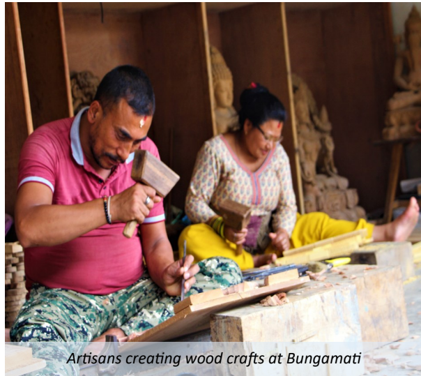
Artisans creating wood crafts at Bungamati