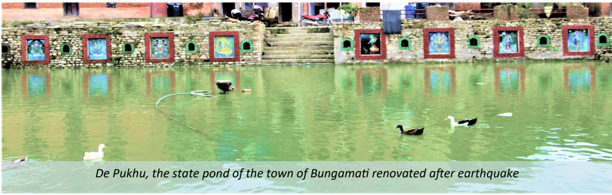
De Pukhu, the state pond of the town of Bungamati renovated after earthquake