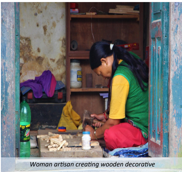
Woman artisan creating wooden decorative