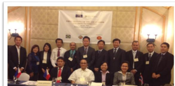
ASEAN SHINE Steering Committee meeting, June 2014