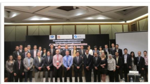
Launching of the APEC-ASEAN Harmonization of Energy Efficiency Standards for Air Conditioners report, October 2012